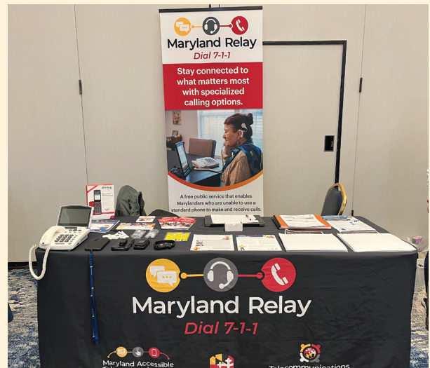
Point View Aspen Hill Health Fair & AACF Lunar New Year