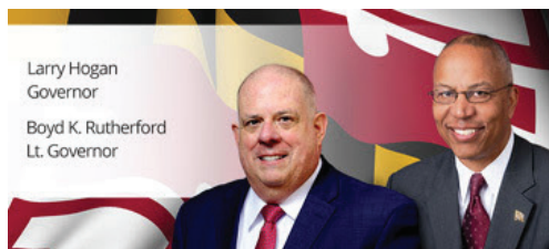
Larry Hogan Governor

301 West Preston Street, Suite 1008A Baltimore, Maryland 21201