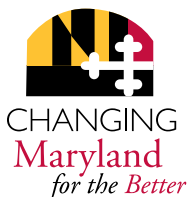
Boyd K. Rutherford Lt. Governor