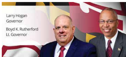
Larry Hogan Governor

301 West Preston Street, Suite 1008A Baltimore, Maryland 21201