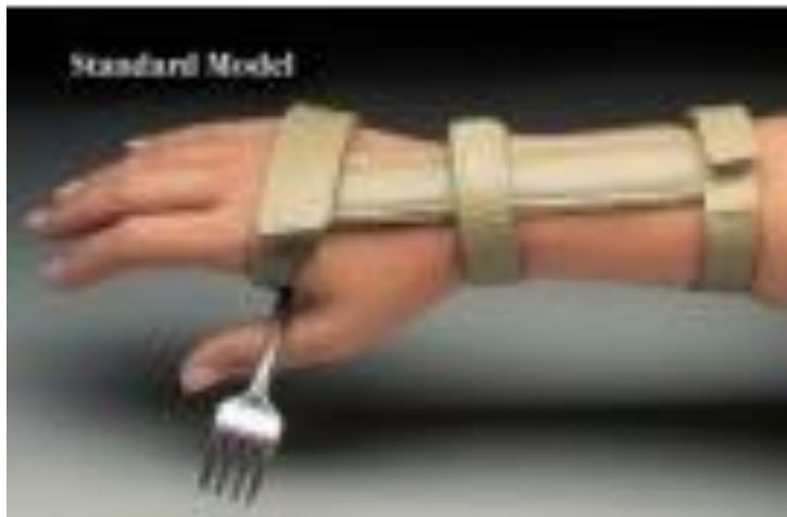
Wrist and forearm support