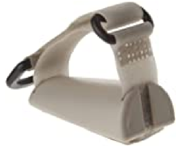
Velcro wrist strap