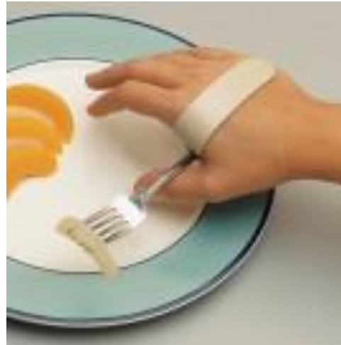
plastic slip on